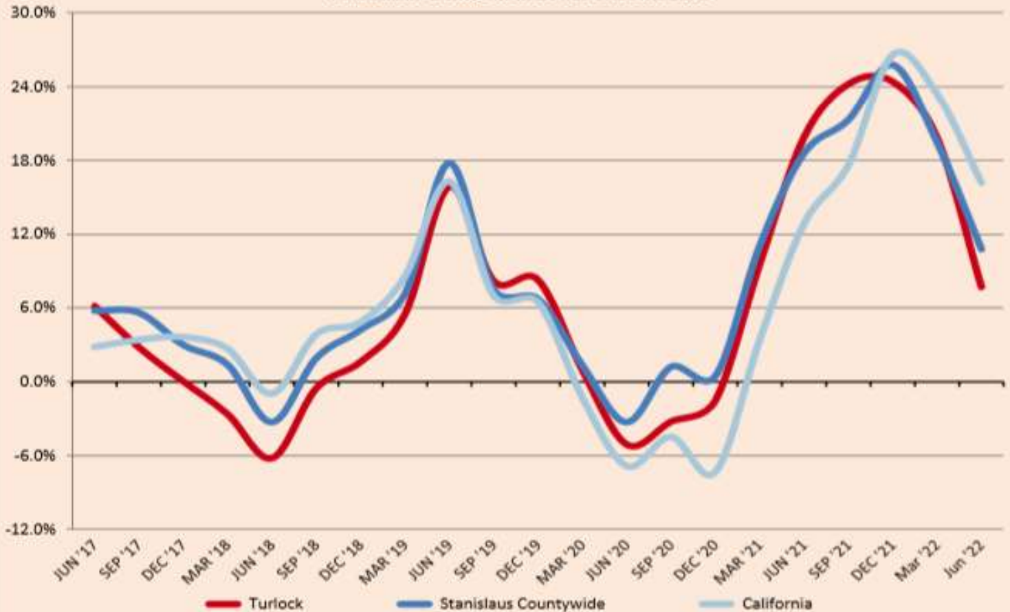
Sales Tax Revenue on a Cash Basis